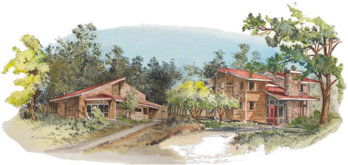
William Penn Mott Jr. Training Center